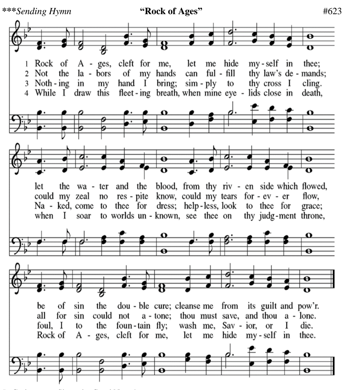
L: Go in peace. Share the Good News!